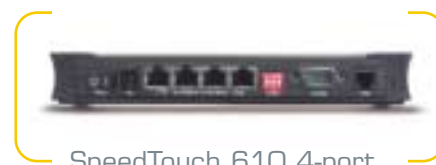
SpeedTouch 610 4-port