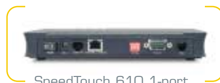
SpeedTouch 610 1-port